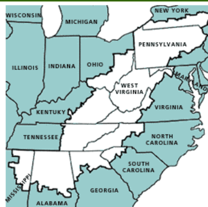
A map of Appalachia