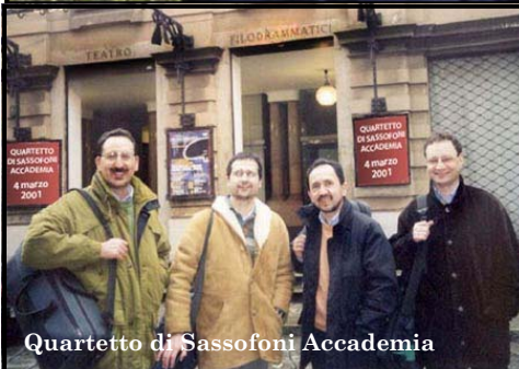
Quartetto di Sassofoni Accademia

... and this is just the beginning of the Odyssey!