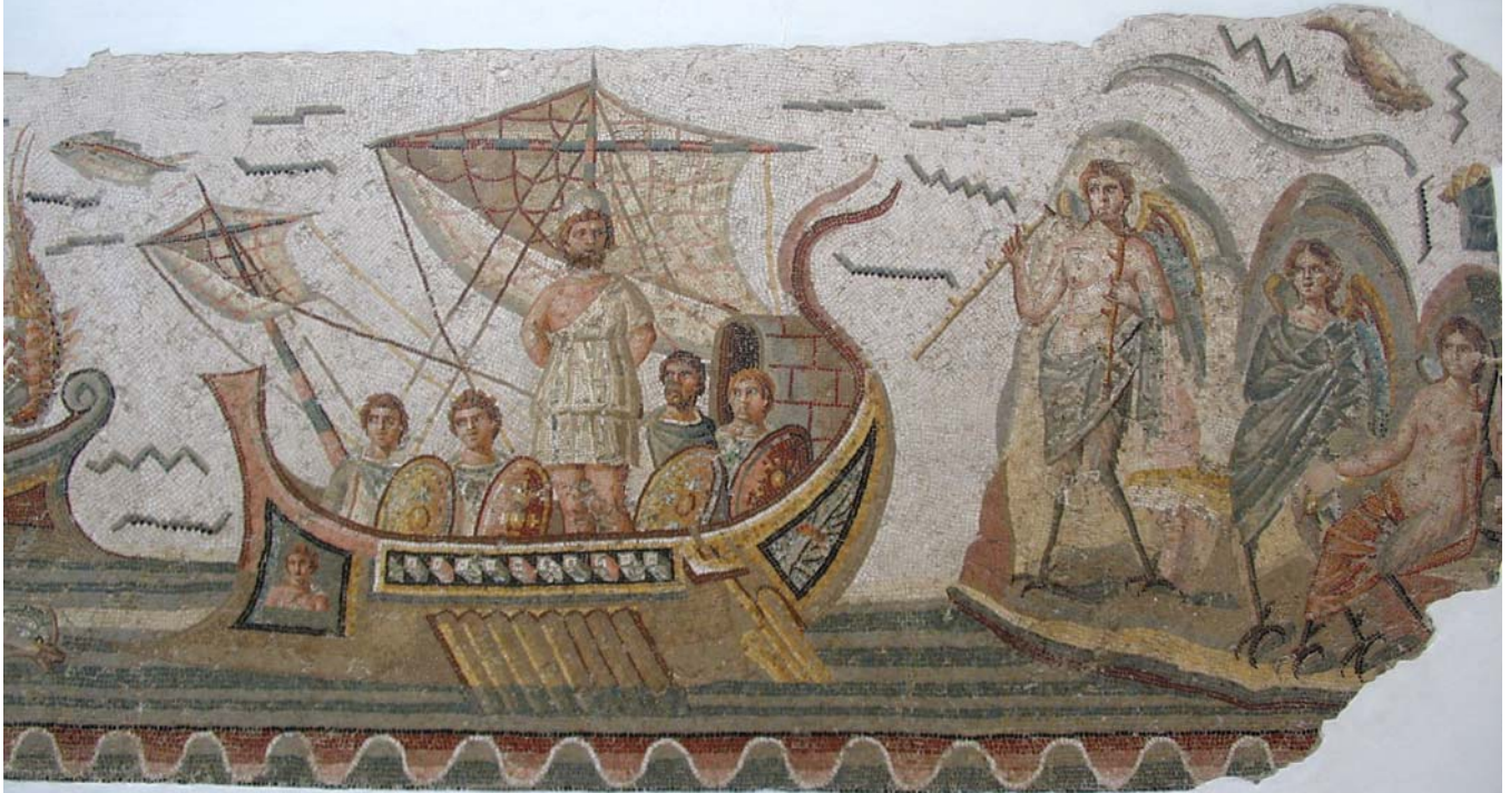
Guests arriving for Cruise Nite in 1184 B.C.